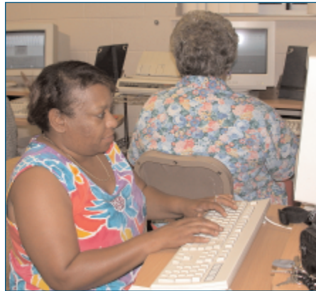
Above: A resident bones her computer skills in the on-site Computer Lab.

Staffing for the 188-unit apartment community includes a full-time on-site Resident Services Specialist who links residents with community resources ranging from health care and transportation services to educational programs and social events. The development also offers on-site health care to eligible tenants as well as an exercise room, social and educational events, and more.