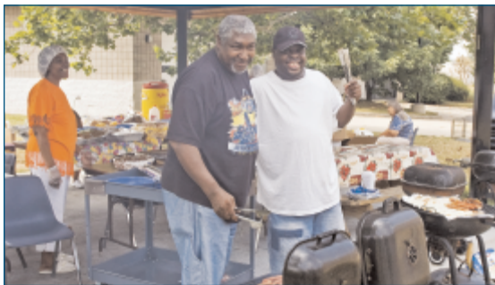
Left: Residents enjoy regularly scheduled social events and outings—something for everyone!