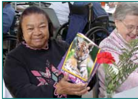
Leonard Terrace is a fun and friendly place to call home!