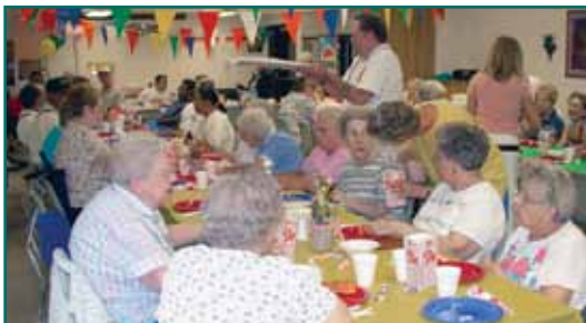
Left: Local churches and community agencies partner with GRHC staff to offer special events in the well-equipped Leonard Terrace Community Room.