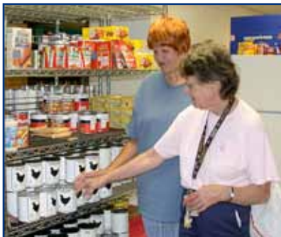
Left: An on-site food pantry offers residents canned, dry and frozen foods, hygiene and cleaning products, and other pantry staples.