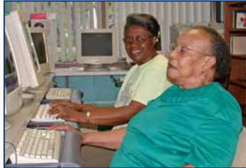
Ransom Tower residents enjoy the development's on-site computer lab.

The 153-unit development features a kitchen-equipped Community room as well as an on-site food pantry and computer lab. Staffing at the development includes a Resident Services Specialist dedicated to helping residents find and access resources ranging from health care and transportation to recreational and social opportunities.