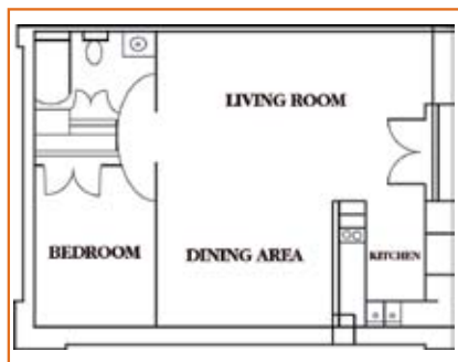
Floor plan of a 750-square-foot one-bedroom unit in the development's two-story, multi-unit building.

Sheldon Apartments is accepting applications from prospective tenants aged 55 and older.