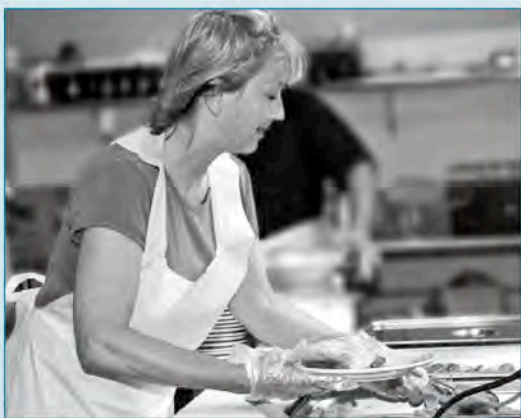
Mount Mercy’s Senior Meals café offers lunch each weekday. Visit grhousing.org to learn about amenities unique to our other retirement developments.

For a limited time, four GRHC retirement developments are offering new tenants their first month rent free!