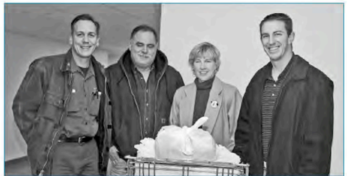
Employees of Hurst Mechanical deliver groceries and holiday gifts to the residents of Mount Mercy Apartments.