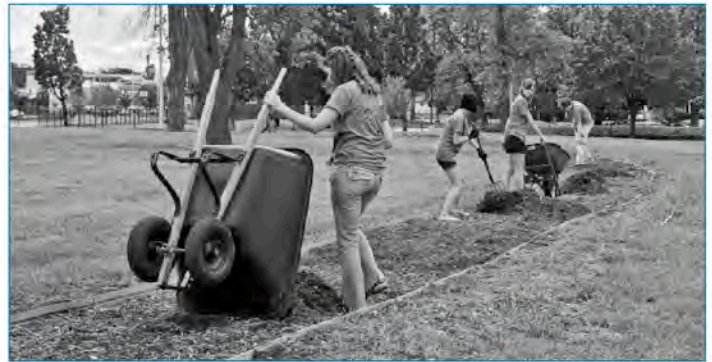
Calvin College StreetFest student volunteers help with fall landscaping chores at Campau Commons Apartments.

Congratulations to these winners, and many thanks to all of the community organizations and volunteers who support our residents and agency!