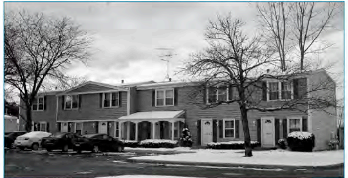
Housing units at Rolling Pines Apartments, 4650 Ramswood Drive NE.

The Housing Commission has agreed to administer Section 8 “enhanced” vouchers at Rolling Pines Apartments, a 152-unit development on Grand Rapids’ northeast side. Rolling Pines was recently converted from HUD’s Section 8 Project-Based Program, which provides a federal rental subsidy tied to a specific building or units in a building, to a market-rate property; this means units are no longer rent-subsidized. The conversion process gave existing eligible low-income tenants the opportunity to receive a tenant-based Section 8 rental subsidy while they continue to live at Rolling Pines.