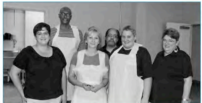
Senior Meals Program, Inc., staff and resident volunteers make the Mount Mercy Apartments "Café on The Mount" a popular lunch spot.