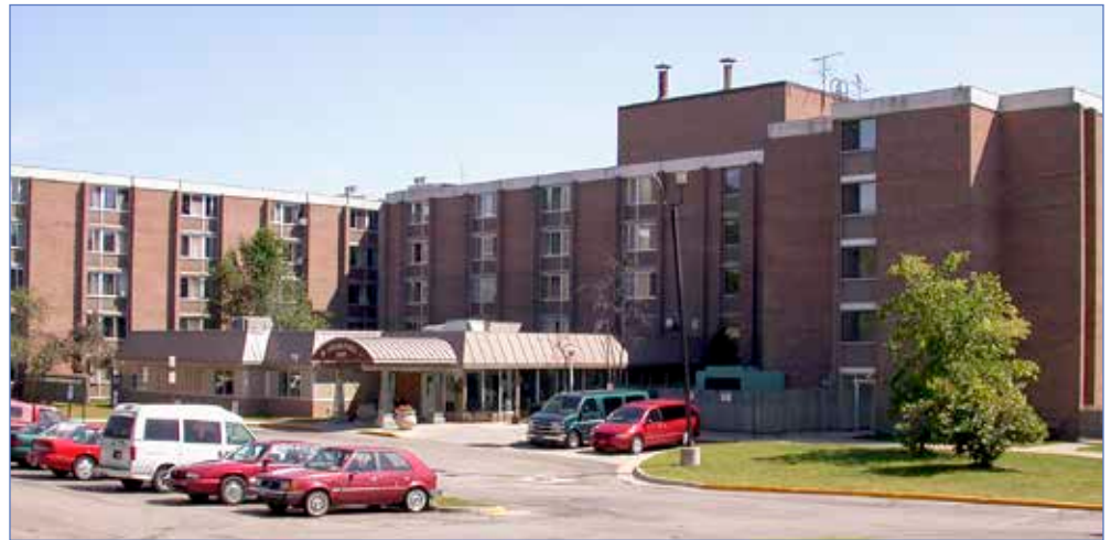
1440 Fuller Avenue SE, Grand Rapids, MI 49507 | (616) 235-2865

Conveniently located near shopping and transportation, Adams Park is a 188-unit development that serves people with disabilities and seniors ages 62 and older. Eligible tenants receive a federal rental subsidy, which means rent is not more than 30 percent of the household's adjusted monthly income.