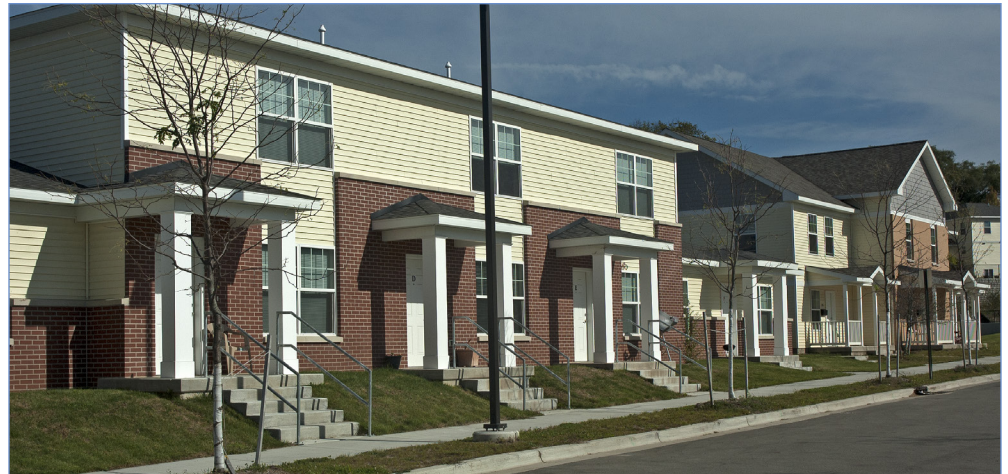
1080 Creston Plaza Drive NE, Grand Rapids, MI 49503 | (616) 235-2646

Located near shopping and public transportation in a well-established Grand Rapids neighborhood, Creston Plaza offers affordable housing to low-income households, including families, senior citizens and people with disabilities.