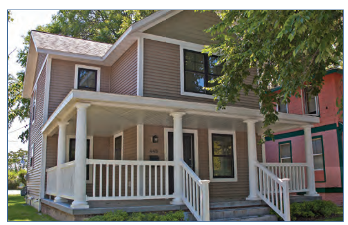
One of 15 Scattered Sites homes being renovated in preparation for sale

The GRHC continues to work toward selling the remaining 15 Scattered Sites home ownership units in our Low-Income Public Housing inventory. A total of $749,000 in capital needs at these properties are currently being addressed, after which the Housing Commission will apply for disposition through the HUD Section 18 Program.