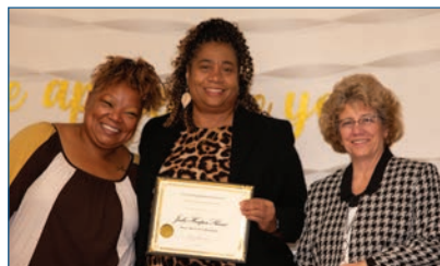
Above: GRHC community partners gather for lunch in the Sheldon Apartments Community Room; a few of many partner recognition award presentations